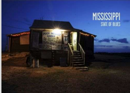
Photographs of Club Ebony from the Mississippi Blues Commission Blues Trail , a 300-mile driving trail in Mississippi. Courtesy, the Mississippi Blues Commission. www.msbluestrail.org