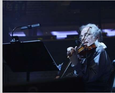
Multiple Grammy Award-winning violinist Itzhak Perlman. Left: practicing at home. Right: on stage. From the documentary Itzhak, airing on American Masters October 14 (check local listings). www.pbs.org/wnet/americanmasters/itzhak