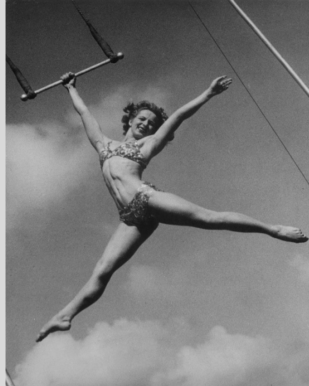
The circus aerialist La Norma Fox, from the documentary The Circus airing on American Experience October 8 (check local listings). www.pbs.org/wgbh/AmericanExperience/films/circus

CARNEGIE MUSEUM OF NATURAL HISTORY, Pittsburgh, PA Alcoa Foundation Hall of American Indians Long-term. www.carnegiemnh.org