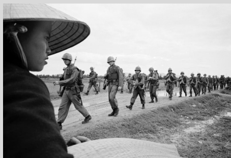
Marines marching in Danang, March 15, 1965. From the documentary The Vietnam War , rebroadcasting on October 3, 2017. www.pbs.org/kenburns/the-vietnam-war/home

BROOKLYN HISTORICAL SOCIETY, WEEKSVILLE HERITAGE CENTER, IRONDALE CENTER, Brooklyn, NY In Pursuit of Freedom Long-term. Organized by the Brooklyn Historical Society. www.brooklynhistory.org