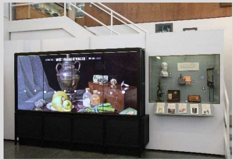
Exhibit display from How Medicine Became Modern at the Dittrick Museum of Medical History, Case Western Reserve University. artsci.case.edu/Dittrick

CHIPPEWA VALLEY MUSEUM, Eau Claire, WI Changing Currents: Reinventing the Chippewa Valley Long-term. www.cvmuseum.com