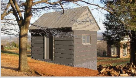
Single-family log slave dwelling from Mulberry Row and the Landscape of Slavery at Jefferson's Monticello at Monticello, Charlottesville, Virginia. www.monticello.org

MUSEUM OF THE CHEROKEE INDIAN, Cherokee, NC Emissaries of Peace: The 1762 Cherokee/British Delegations Long-term. www.cherokeemuseum.org