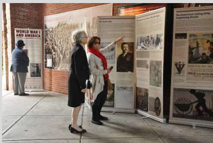
Patrons view the World War I and America traveling exhibition, currently at several sites around the country. wwiamerica.org