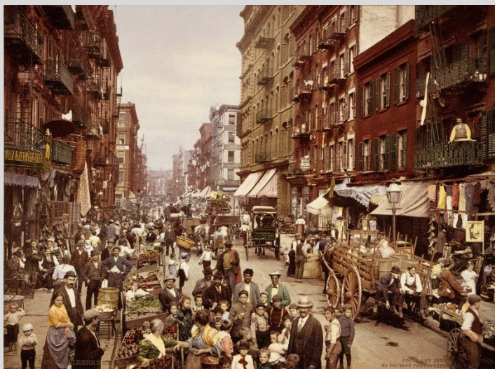
Mulberry Street, Manhattan, ca. 1900. From the exhibition New York at Its Core at the Museum of the City of New York.