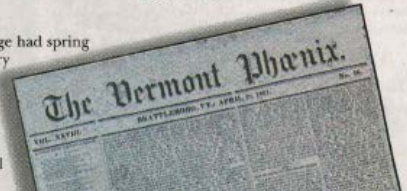
Times Argus (May 6, 2012): A1

Rather, the front page had spring gardening tips, a story about astronomy and some fiction; the only reference to the Civil War was a poem by Oliver Wendell Holmes, "A Voice from a Loyal North."