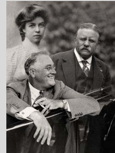
Promotional image from the documentary "The Roosevelts" airing on PBS September 14 (check local listings). www.pbs.org/kenburns/films/the-roosevelts