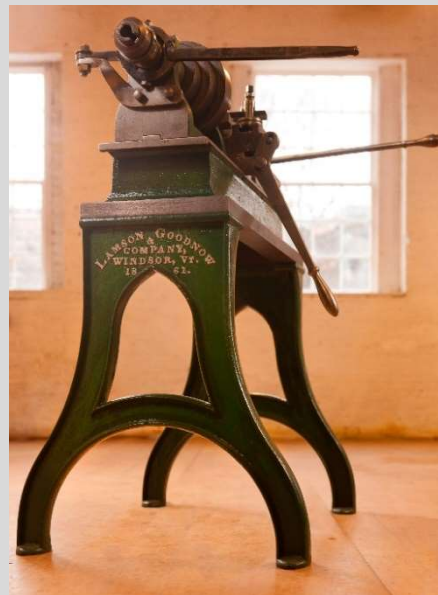
Lamson Goodnow & Co made metal planers and turret lathes then sold to the major armorers outfitting the Union, from the exhibition Shaping America at the American Precision Museum, Windsor, Vermont. www.americanprecision.org