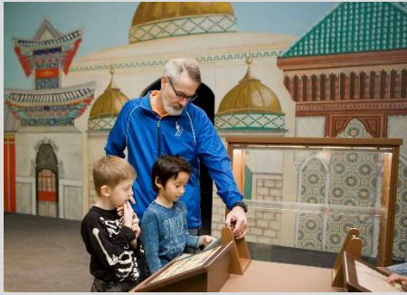
Visitors engaged at an interactive display from the exhibition America to Zanzibar: Muslim Cultures Near and Far at the Children's Museum of Manhattan.