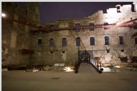
Ruins of a courtyard from the Mill City Museum, Minneapolis, Minnesota. www.millcitymuseum.org

MINNEAPOLIS INSTITUTE OF ART, Minneapolis, MN Material Journeys: African Art in Motion Reinstallation. Organized by the Minneapolis Society of Fine Arts. www.artsmia.org