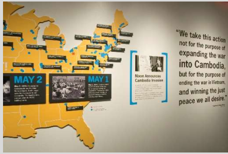
Gallery One Protest Map from Making Meaning of May 4th: The Kent State Shootings in American History at the Kent State University Visitors Center, Kent, Ohio. www.kent.edu

MILLE LACS INDIAN MUSEUM, Onamia, MN Learn About Our Past: The Story of the Mille Lacs Band of Ojibwe Long-term. Organized by the Minnesota Historical Society. www.mnhs.org