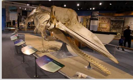
Whale skeleton from the exhibition From Pursuit to Preservation: The Global Story of Whales and Whaling at the New Bedford Whaling Museum, New Bedford, Massachusetts.