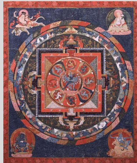
Left image: Shakyamuni Buddha, sixteenth century, Eastern Tibet. Right image: Hevajra Mandala, seventeenth century. Both from the online exhibition Explore Art . Courtesy, Rubin Museum of Art. exploreart.rma.2.org