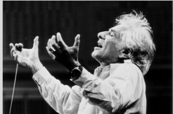
Image of Leonard Bernstein conducting from the exhibition Leonard Bernstein: The Power of Music at the National Museum of American Jewish History, Philadelphia, Pennsylvania. Courtesy, Leonard Bernstein Office, Inc. Photo, Paul de Hueck. www.nmajh.org