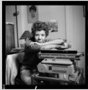
Lorraine Hansberry leans over her typewriter in her Greenwich Village apartment on Bleecker Street during her April 1959 photoshoot for Vogue. From the documentary Sighted Eyes/Feeling Heart. www.pbs.org/show/american-masters

BOSTON CHILDREN'S MUSEUM, Boston, MA Boston Black: A City Connects Long-term. www.bostonkids.org