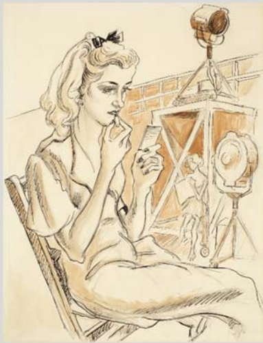
Thomas Hart Benton, Member of the Chorus, 1937, ink, ink wash, and graphite on paper, 13 3/4 x 10 3/8 in. Private collection. From the exhibition American Epics: Thomas Hart Benton and Hollywood at the Amon Carter Museum of American Art, Ft. Worth, Texas.