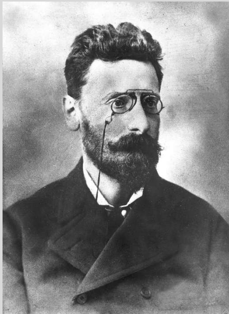
Joseph Pulitzer portrait. From the documentary Joseph Pulitzer: Voice of the People airing on PBS April 12 (check local listings). www.josephpulitzerfilm.com